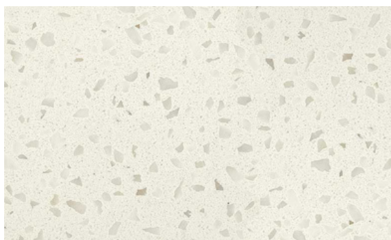
SANTORINI (SANTORINI COLLECTION)