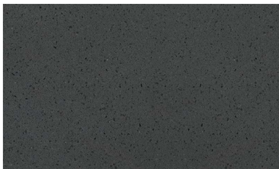
MARENGO (MILAN COLLECTION)