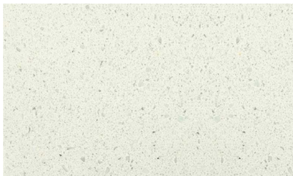
ASTRAL (SANTORINI COLLECTION)