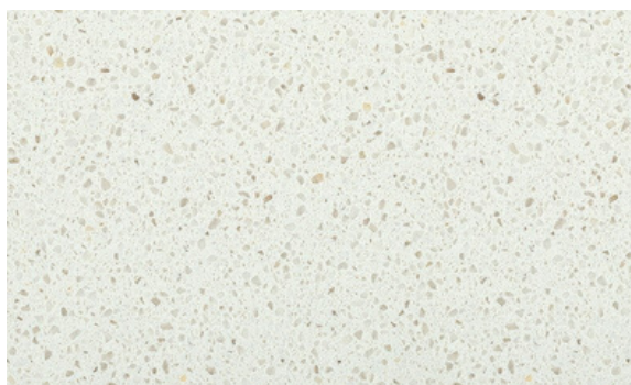
GELSOMINO (SANTORINI COLLECTION)