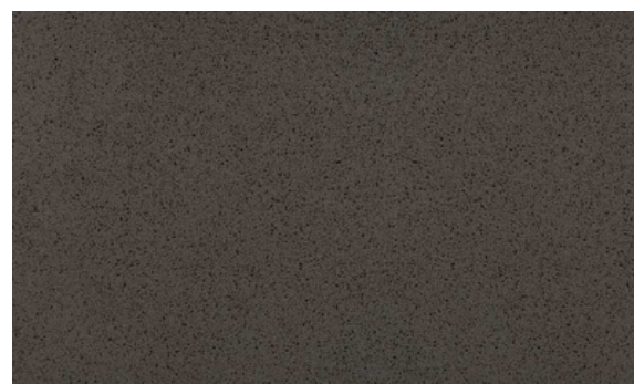
NAXOS (PARIS COLLECTION)