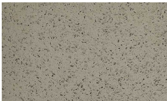
TRITON (PARIS COLLECTION)